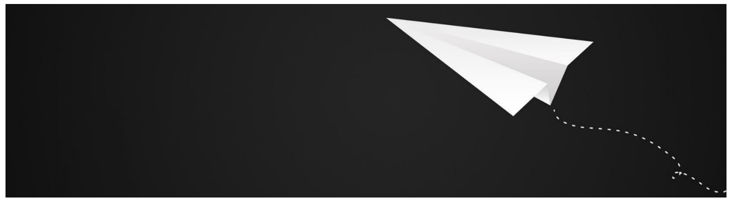
Message from the Principal